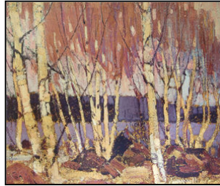
EVENING CANOE LAKE