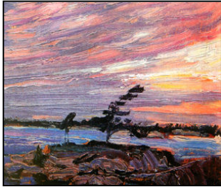
EVENING SPLIT ROCK

The best-known Canadian landscapist of his time, Tom Thomson, b. Claremont, Ont. Aug. 4, 1877, made his first trip to Algonquin Park in northern Ontario in 1912. His wilderness subjects had great influence on later Canadian landscapists, especially the Group of Seven. Although his career was cut short by his tragic drowning in 1917, he has since become a legendary figure in Canadian painting.