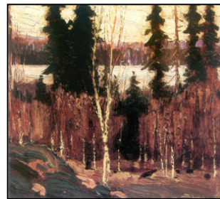
SOUTH SHORE, CANOE LAKE