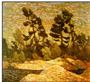
BYNG INLET, GEORGIAN BAY