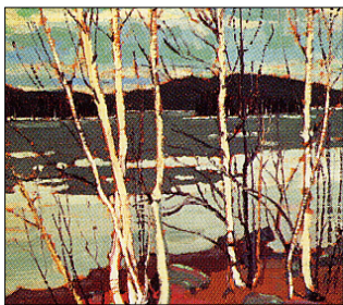
SPRING IN ALGONQUIN PARK