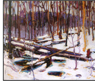
SNOW IN THE WOODS