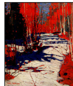
BEHIND MOWAT'S LODGE